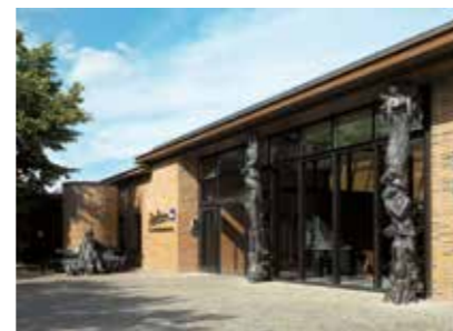
1 Radisson Blu H.C. Andersen Hotel