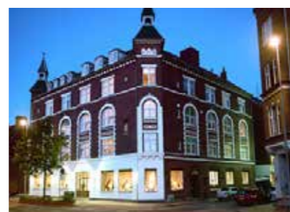
4 Hotel Ansgar