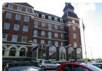
2 Hotel Plaza Odense